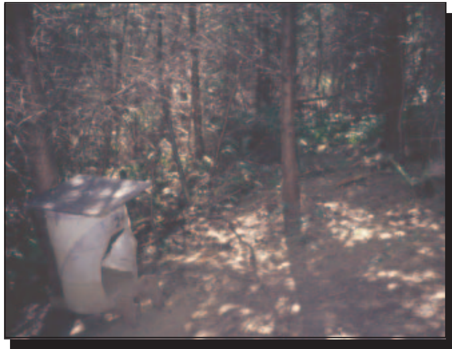
Figure 3—A feeding station that dispenses pellets with a high concentration of sugar. When they had the opportunity, bears tended to feed on pellets rather than strip bark from trees.

Feeding Stations —Most forest managers in western Washington use similar approaches when feeding bears. Feeding stations (figure 3) are constructed from 55-gallon (250-liter) metal or plastic drums. An opening in the front provides access to pellets. A simple self-feeding delivery system prevents bears from spilling pellets. A foam-insulated plywood roof keeps pellets dry. A single feeder holds about 90 kilograms of pellets. Commercial pellets are about 0.6 centimeter in diameter and 1.3 centimeters long. They resemble dry commercial dog food, but are greenish. The sugar concentration in pellets is high (about 20 percent) and