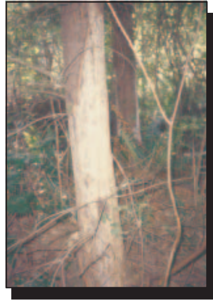
Figures 2a and 2b—Douglas-fir trees peeled by a black bear feeding on sugars in the newly formed wood beneath the bark.